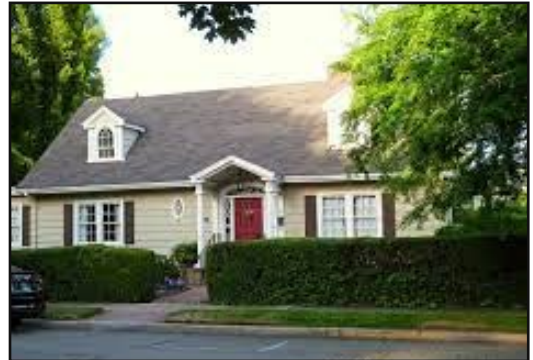
Colony Club on Geneva Street