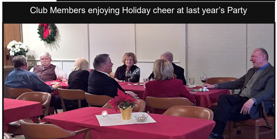
Club Members enjoying Holiday cheer at last year's Party