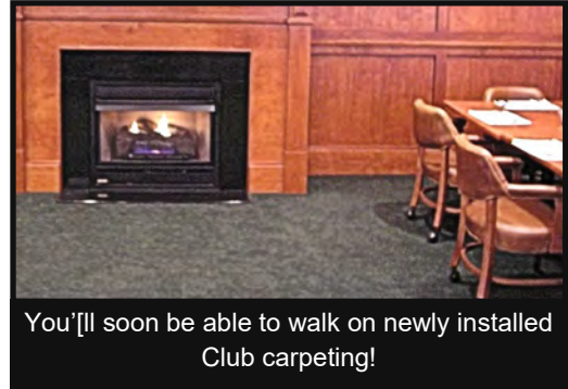
You'll soon be able to walk on newly installed Club carpeting!

Two major Club improvements are in progress. The Board has approved using funds provided from the Club Improvement Campaign which was announced last November to replace the main dining room carpet. While it may not be readily apparent, the carpeting has aged during its 15 years' service and which has created both safety and appearance concerns.