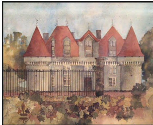
Monbazillac winery in Southern France